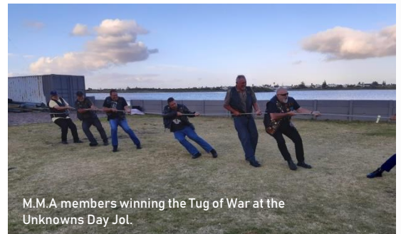
M.M.A members winning the Tug of War at the Unknowns Day Jol.