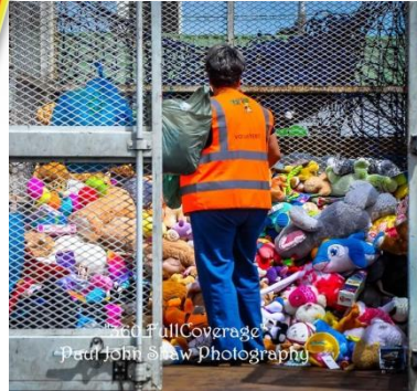
Filling up the trailers with toys, toys and loads more toys!

Many underprivileged children will each have a gift for Christmas thanks to you and all those that attended.