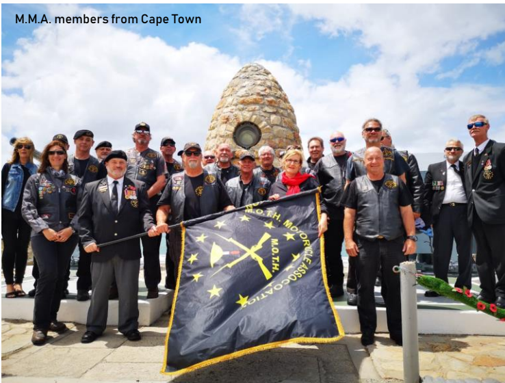
M.M.A. members from Cape Town

THE CHILDREN'S HOSPITAL TRUST DAY OF REMEMBRANCE, RONDEBOSCH