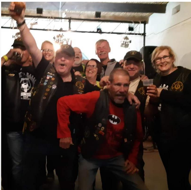
M.M.A. members celebrating their Best Attended Club Award.

Arriving safe with some more wet than others, we none the less had a blast and walked away with the award for Best Attended Club at the rally.