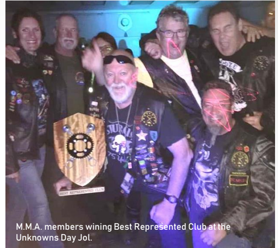
M.M.A. members winning Best Represented Club at the Unknowns Day Jol.