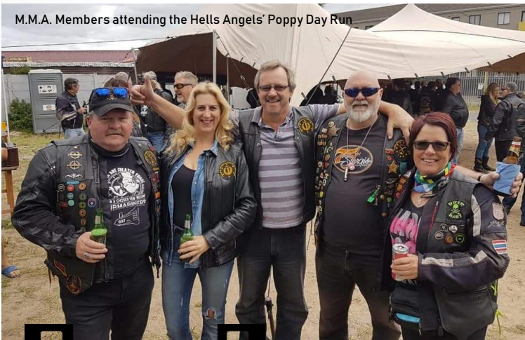
M.M.A. Members attending the Hells Angels' Poppy Day Run

We have attended various events over the last few months showing our support and displaying our colours. To name a few: The Hells Angels' Poppy Day Run, Day of the Dead and all the annual Day Jols. Here are just a few snapshots.