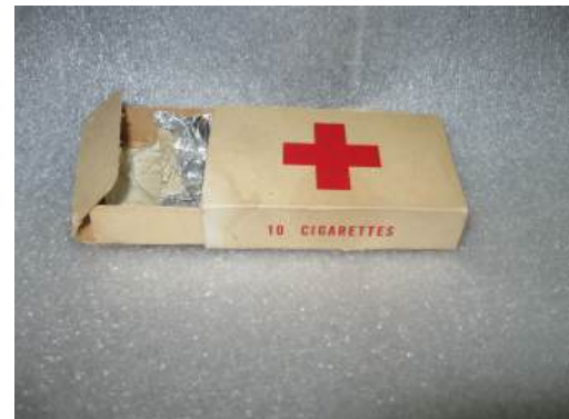
Bribes for the guards.

Colour was, at first, limited to blue ink, then it was found that quinine tablets, when crushed in water, produced a yellow dye. A mixture of blue and yellow gave green. Later a kiddies paint box was obtained from one of the guards in exchange for Red Cross Cigarettes! Each edition was bound with an MMC badge on the cover cut with a razor blade from an aluminium mess can. The scripts had to be done by hand on the top bunk of a tier of three with knees up and ears shut to the many 'noises off'. An eight-man committee meeting on a top bunk almost proved fatal when it collapsed onto the poor fellow in the middle bunk! The 36 page magazine books were passed from hand to hand among the rapidly growing club membership. Later, the camp in general was catered for by a 'Flywheel Supplement' wall sheet backed by a plywood board from a Red Cross crate. Alan Vidow, as circulation manager, kept track of the magazine (time allowed, two hours per reader) and moved the supplement board to allow a half-day display per hut. Eventually readership of the wall sheet was estimated to be in the region of 10 000 per issue!