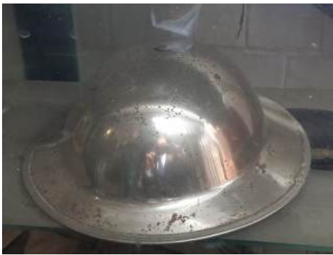
Now tha'ts a beautiful hat!