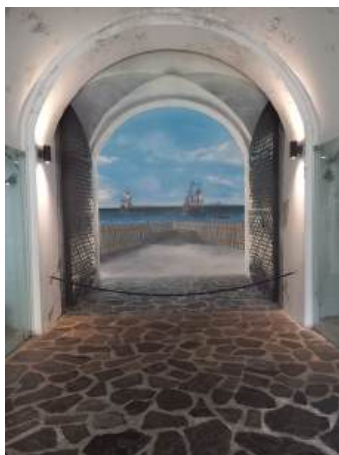
Still an amazing place to visit with lots to admire within.