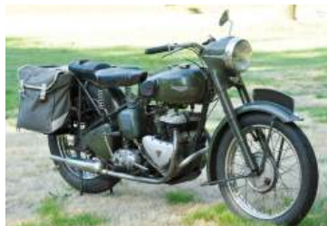
Triumph TRW 500