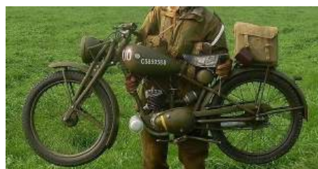
Royal Enfield Flying Flea