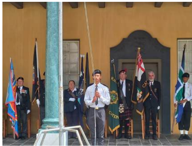
The cadets carried themselves with pride and dignity as usual.