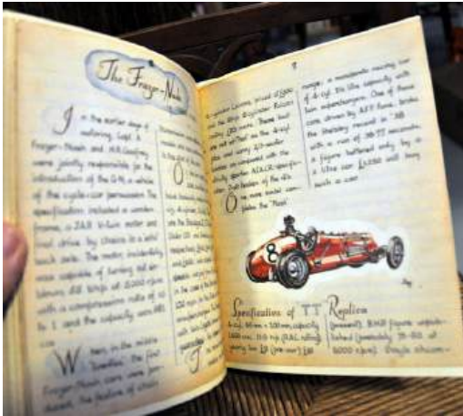
A labour of love