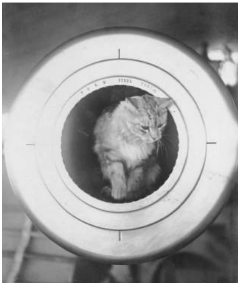
His favorite resting spot