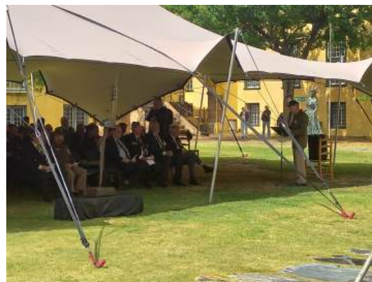
The seating arrangements were comfortable and protected us against the elements that day.