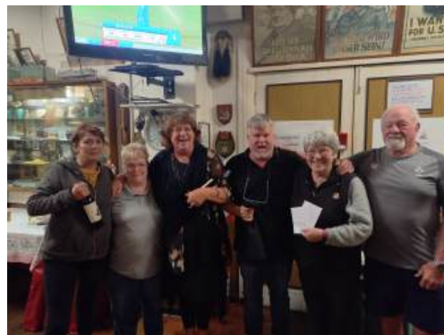
A bunch of jokers....but still no winner!