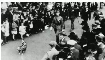
Stubby loved a good parade.