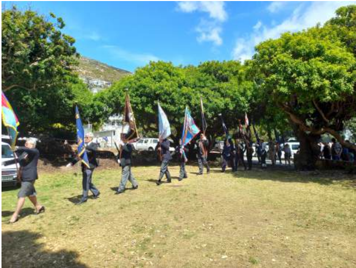
Arriving at the destination