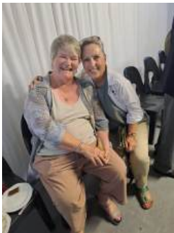
Two lovely ladies and staunch cadet supporters.