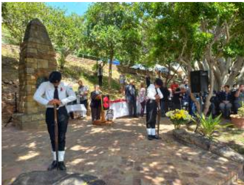
The sentinels stand guard