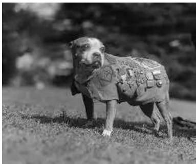
A soldiers best friend.

It is hard to picture Stubby without his famous jacket. The jacket had many medals fixed on it, including the Purple Heart, the Republic of France Grande War medal and the Medal of Verdun.