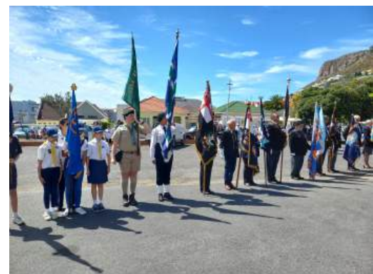
A wondrous amount of banners on display