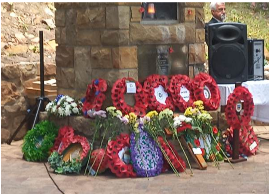
An amazing amount of wreaths were laid down making for a beautiful and moving display.