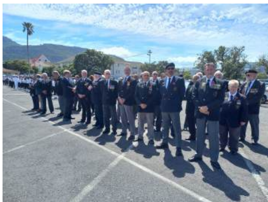
The troops assemble