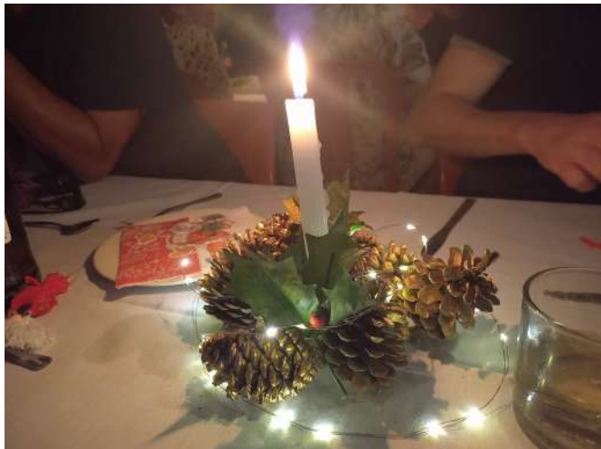
The atmosphere was as joyous as the guests.