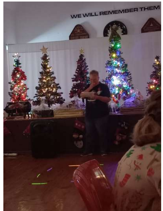
The cheer takes off!