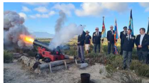
Saturday morning firing of the cannon to commemorate The Battle of Blouberg,