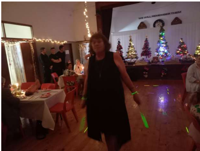
In-flight instructions from our lovely staff