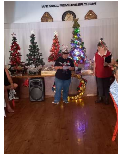
Oh Captain, my Captain