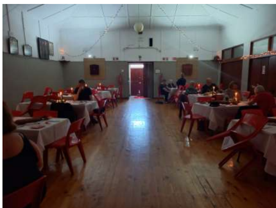
The hall was decked and looked beautiful