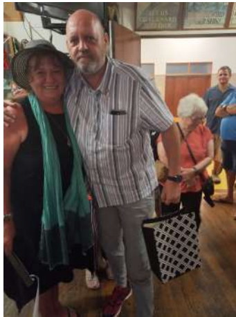
Love and prizes, both are in abundance at Battledress