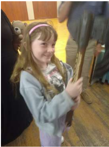
The newest Battle Axe member, "Babyaxe"