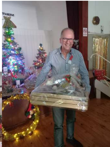
A selection of photos showing some of Santas favorites. These elves had the luck of St Nick on their side and went home with some incredible raffle prizes.