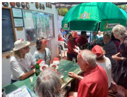
It was a house full of cheer