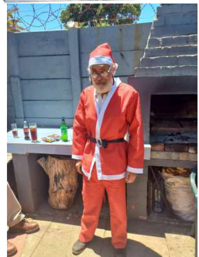
Even Santa could not stay away