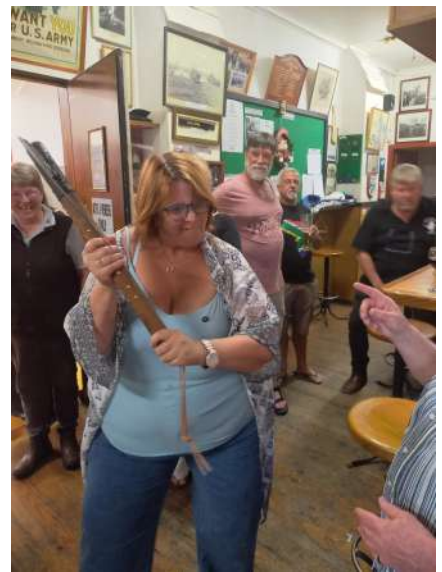
Ready to massacre all challenges.

Battle Axes and honoury members. We owe so much to their hard work and dedication. Thank you all.