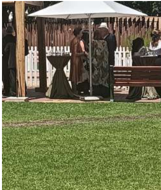
Dugout at the Commonwealth War Graves, if you look carefully you will see Princess Anne in attendance!