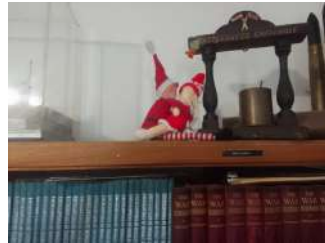
"Somebody found the 50 Shades of Grey book." Chokkie