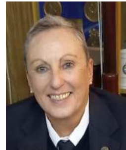
The Goose is on the Loose!