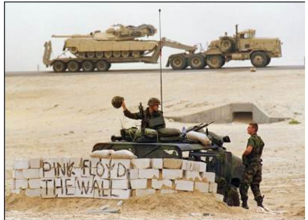
U.S. Army Military Police guard their checkpoint along a convoy route in the Saudi desert, Jan. 20, 1991. The MP's said they wrote the name of their favorite record album on the cinder block wall.

August 2, 1990 - The Iraqi army invaded Kuwait amid claims that Kuwait threatened Iraq's economic existence by overproducing oil and driving prices down on the world market. An Iraqi military government was then installed in Kuwait which was annexed by Iraq on the claim that Kuwait was historically part of Iraq. This resulted in Desert Shield, the massive Allied military buildup, and later the 100-hour war against Iraq, Desert Storm.