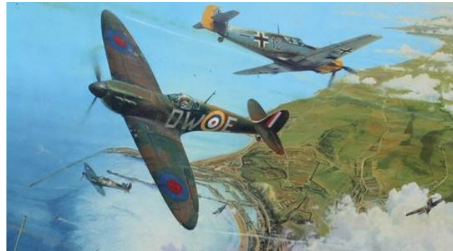
Their Finest Hour