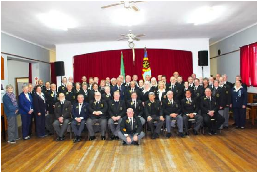
All in attendance