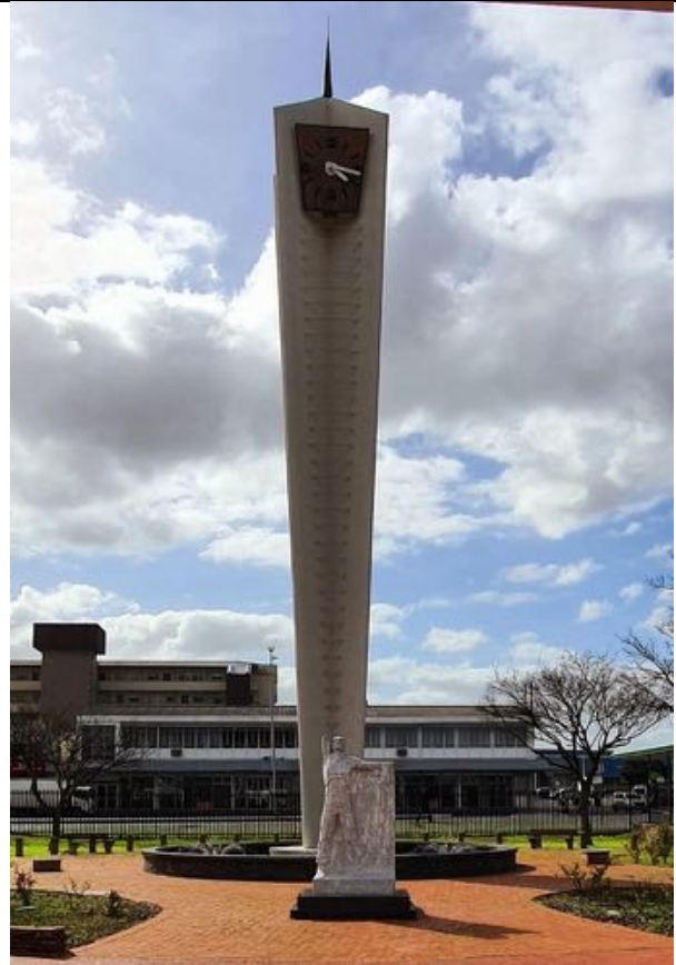
Bellville Cenotaph under the Clock Tower