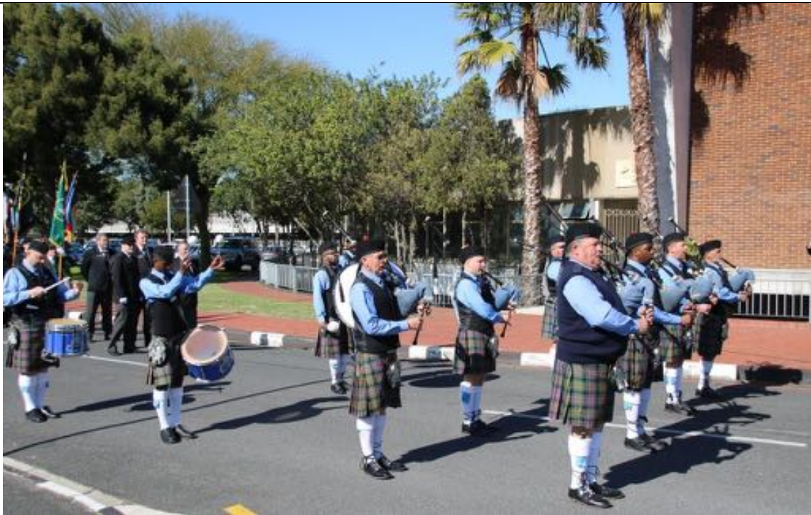
The Caledonian Pipe Band