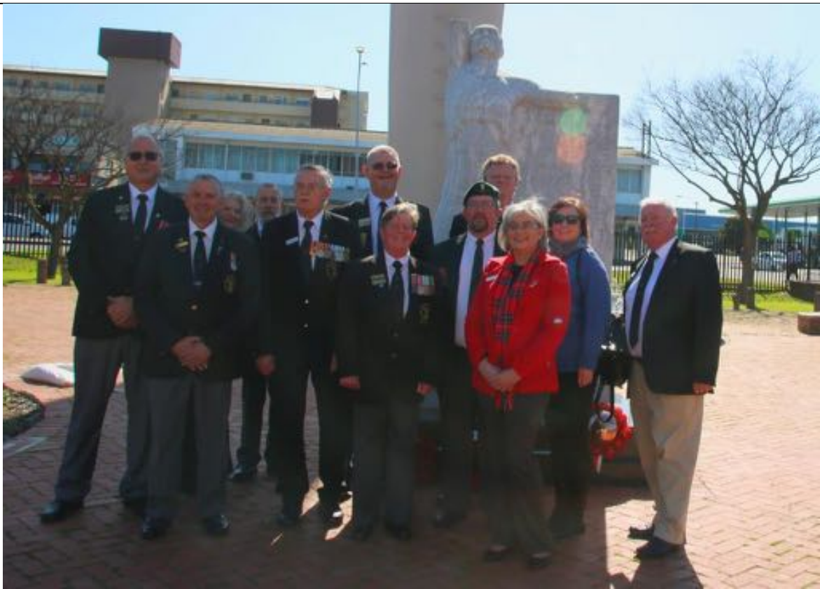
Members of Bomb Alley Shellhole