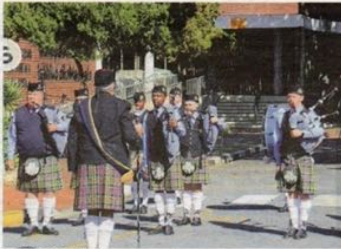
The Caledonian Pipe Band.