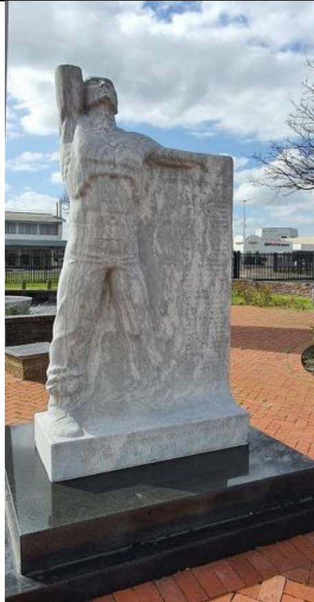
Bellville Cenotaph in front of the Bellville Civic Centre.

Bomb Alley Shellhole, in co-operation with the Bellville Sub Council of the City of Cape Town, once again hosted its annual War Commemoration Service at the Bellville Civic Centre, where a magnificent cenotaph proudly stands on which are listed the names of all those from Cape Town's Northern Suburbs who fell during the two World Wars and also of those of the South African Bush War. There are two more War Memorials in the Northern Suburbs namely Goodwood and Parow War Memorials.