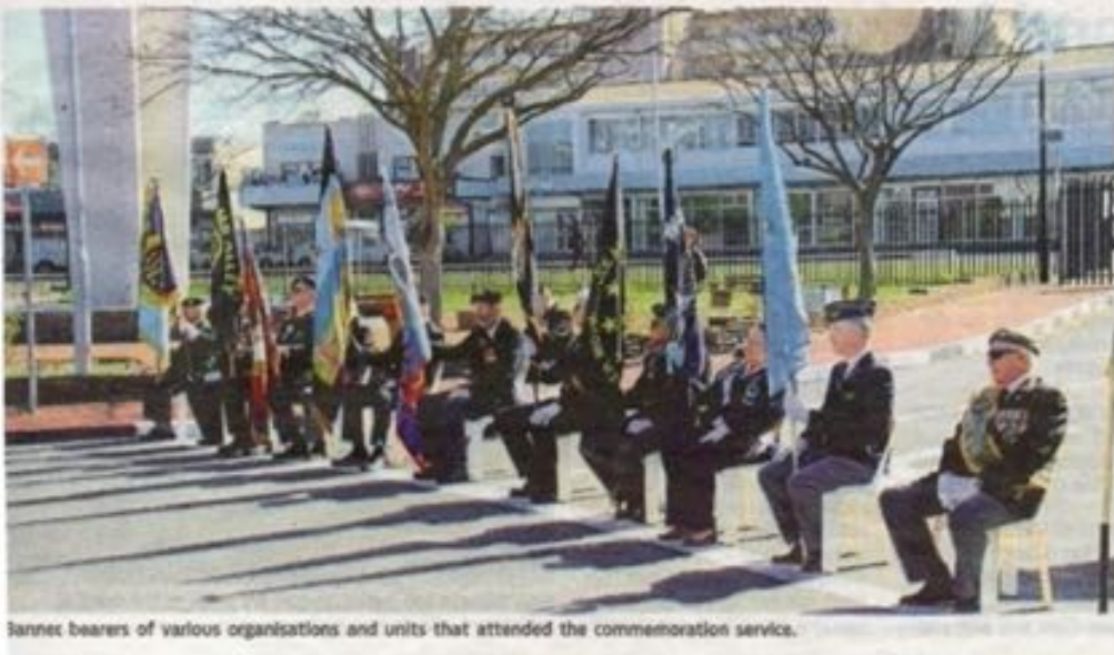
banner bearers of various organisations and units that attended the commemoration service.